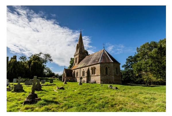
St. Mary - Edvin Loach