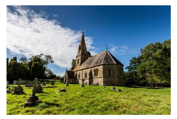
St. Mary - Edvin Loach