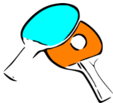
Table-Tennis Club – all abilities – continues on Friday evenings from 5pm in Ollly's Friendship Room. Please wear indoor-only footwear, and just turn up. £1 per person donation welcome! Bats & balls provided.